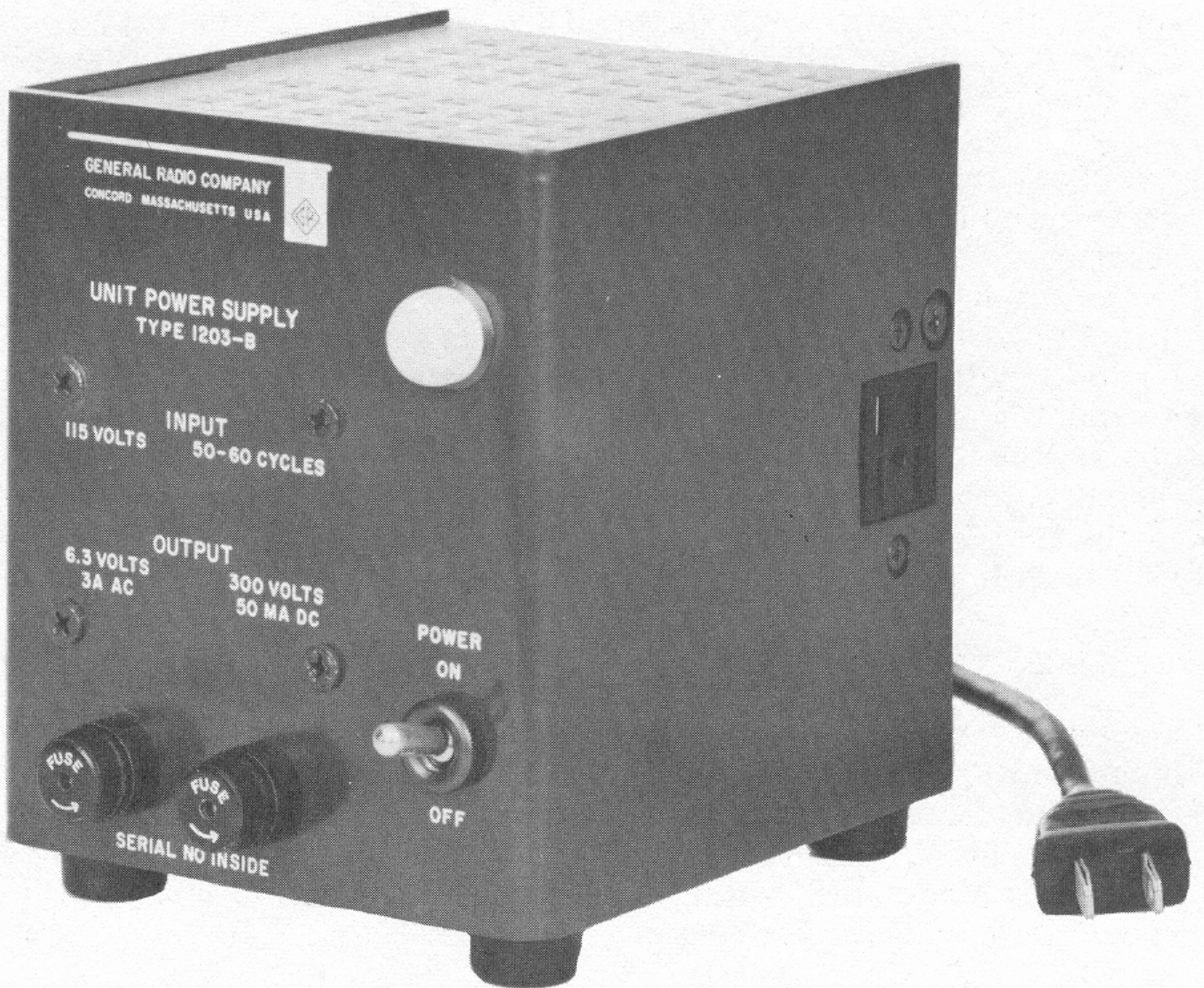
Figure 1. Type 1203-B Unit Power Supply.